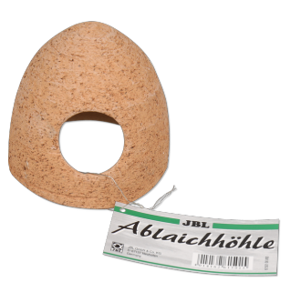
JBL Ceramic spawning cave Ceramic cave for freshwater aquariums