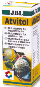
JBL Atvitrol Multivitamin drops for aquarium fish