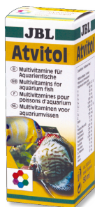
JBL Atvitol Multivitamin drops for aquarium fish