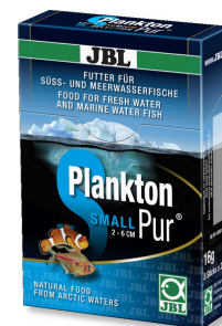
JBL PlanktonPur SMALL Treats for small aquarium fish