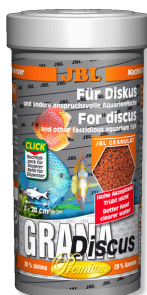
JBL GranaDiscus Premium main food granulate for discus fish