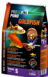
JBL PROPOND GOLDFISH S Food sticks for small goldfish