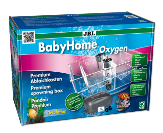
JBL BabyHome Oxygen

Premium spawning box complete kit with air pump