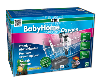
JBL BabyHome Oxygen

Premium spawning box complete kit with air pump