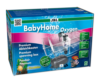
JBL BabyHome Oxygen

Premium spawning box complete kit with air pump