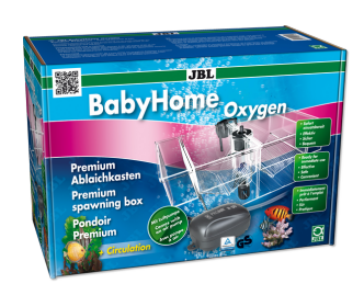
JBL BabyHome Oxygen

Premium spawning box complete kit with air pump