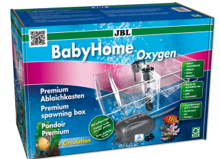
JBL BabyHome Oxygen Premium spawning box complete kit with air pump