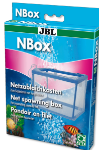
JBL NBox Net Spawning Box