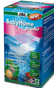
JBL BabyHome pro Air Spawning box for air stone installation