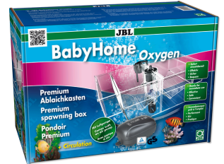
JBL BabyHome Oxygen Premium spawning box complete kit with air pump