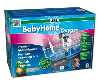
JBL BabyHome Oxygen

Premium spawning box complete kit with air pump