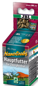
JBL NanoCrabs Main food for dwarf crayfish