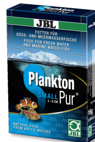
JBL PlanktonPur SMALL Treats for small aquarium fish