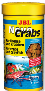
JBL NovoCrabs Main food wafers for crabs