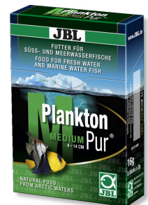
JBL PlanktonPur MEDIUM Treats for large aquarium fish