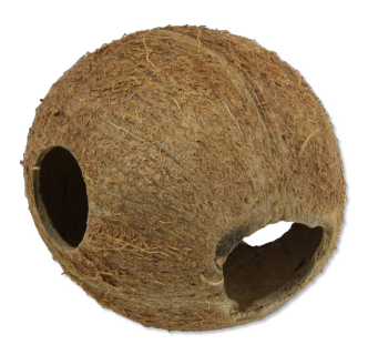
JBL Cocos Cava Coconut cave for aquariums and terrariums