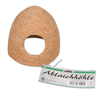
JBL Ceramic spawning cave Ceramic cave for freshwater aquariums