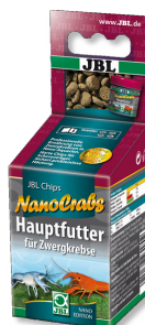
JBL NanoCrabs Main food for dwarf crayfish