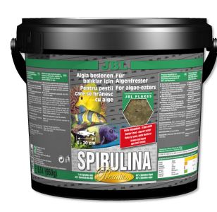
JBL Spirulina Premium main food for algaeeating aquarium fish