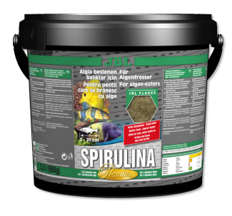
JBL Spirulina Premium main food for algaeeating aquarium fish