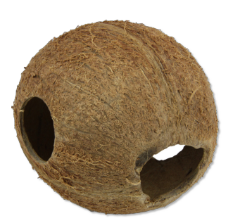
JBL Cocos Cava Coconut cave for aquariums and terrariums