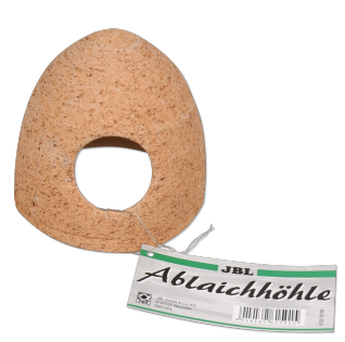
JBL Ceramic spawning cave Ceramic cave for freshwater aquariums