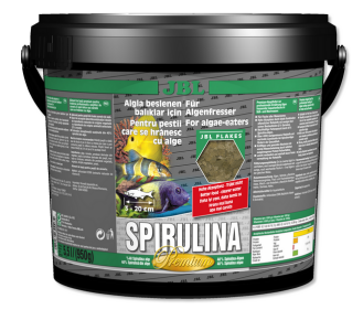
JBL Spirulina Premium main food for algaeeating aquarium fish