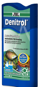
JBL Denitrol Bacteria starter for adding aquarium fish