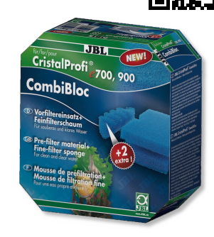
JBL CombiBloc CristalProfi e Pre-filter pads and filter foam for CristalProfi e