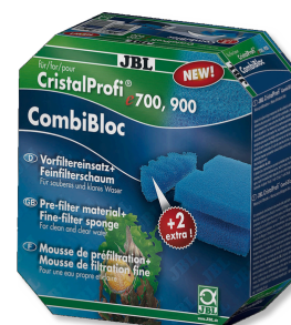
JBL CombiBloc CristalProfi e Pre-filter pads and filter foam for CristalProfi e