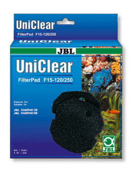
JBL FilterPad F15 Coarse foam pad for aquarium filter CristalProfi