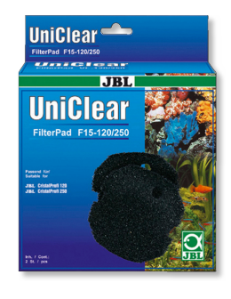
JBL FilterPad F15 Coarse foam pad for aquarium filter CristalProfi