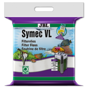
JBL Symec VL Filter wool fleece to remove water cloudiness