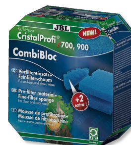
JBL CombiBloc CristalProfi e Pre-filter pads and filter foam for CristalProfi e