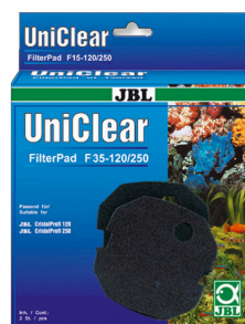
JBL FilterPad F35 Fine foam pad for aquarium filter CristalProfi