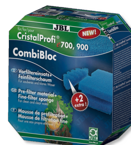
JBL CombiBloc CristalProfi e Pre-filter pads and filter foam for CristalProfi e