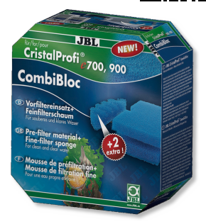
JBL CombiBloc CristalProfi e Pre-filter pads and filter foam for CristalProfi e