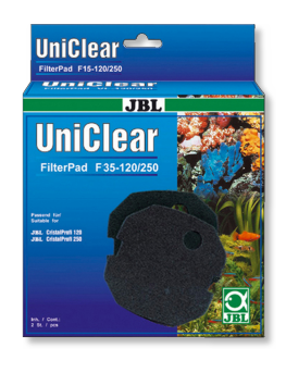
JBL FilterPad F35 Fine foam pad for aquarium filter CristalProfi