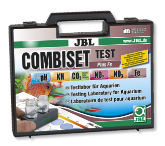
JBL Test Combi Set plus Fe

Test case with most important water tests + iron test