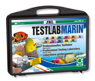
JBL Testlab Marin Professional test case for the analysis of saltwater