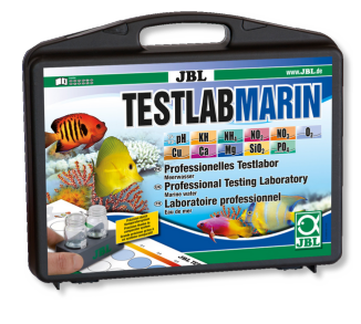
JBL Testlab Marin Professional test case for the analysis of saltwater