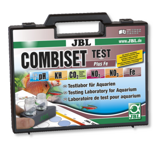
JBL Test Combi Set plus Fe

Test case with most important water tests + iron test