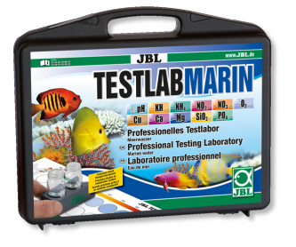
JBL Testlab Marin Professional test case for the analysis of saltwater