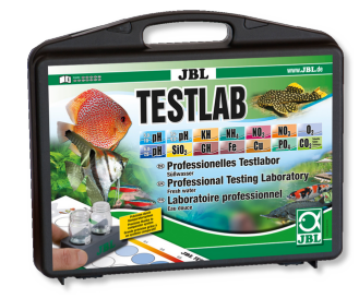
JBL Testlab Test case with 13 tests f. freshwater analysis Testlab