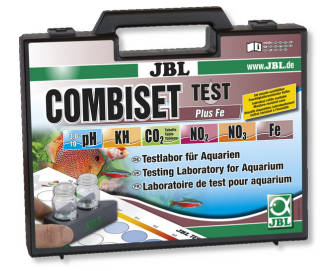
JBL Test Combi Set plus Fe Test case with most important water tests + iron test

You can find a complete overview here: https://www.jbl.de/qr/25348