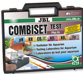
JBL Test Combi Set plus Fe Test case with most important water tests + iron test