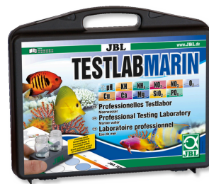
JBL Testlab Marin Professional test case for the analysis of saltwater