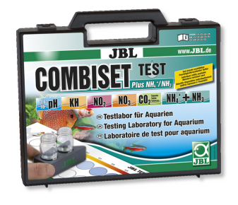
JBL Test Combi Set Plus NH4

Test case with most important water tests + NH4 test