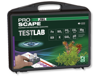
JBL Testlab ProScape

Test case for water analysis in plant aquariums