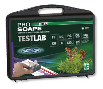
JBL Testlab ProScape Test case for water analysis in plant aquariums