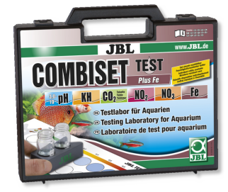
JBL Test Combi Set plus Fe Test case with most important water tests + iron test