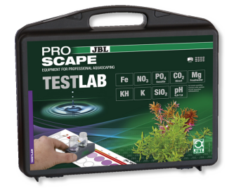
JBL Testlab ProScape Test case for water analysis in plant aquariums