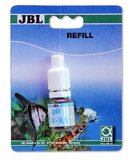
JBL pH Test 7.4-9.0 pH test in aquariums and ponds in the range 7.4-9.0