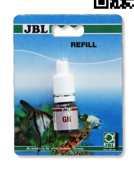
JBL GH Test Quick test to determine the total hardness