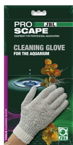
JBL PROSCAPE CLEANING GLOVE Aquarium cleaning glove