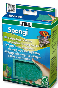
JBL Spongi Cleaning sponge for aquariums and terrariums