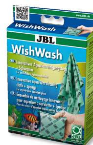
JBL WishWash Cleaning cloth and sponge