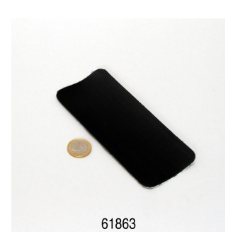
JBL Floaty Pad