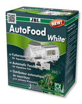
JBL AutoFood WHITE White automatic feeder for aquarium fish