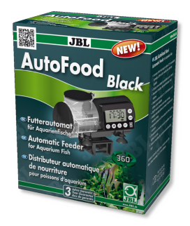
JBL AutoFood BLACK Black automatic feeder for aquarium fish