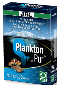
JBL PlanktonPur SMALL Treats for small aquarium fish