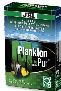
JBL PlanktonPur MEDIUM Treats for large aquarium fish