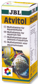
JBL Atvitol Multivitamin drops for aquarium fish