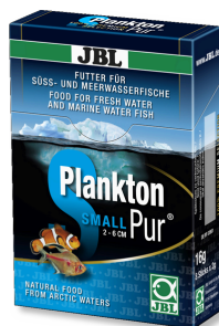
JBL PlanktonPur SMALL Treats for small aquarium fish