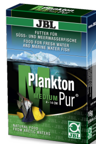
JBL PlanktonPur MEDIUM Treats for large aquarium fish