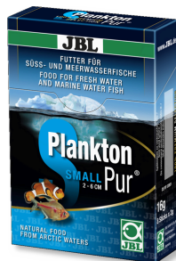
JBL PlanktonPur SMALL Treats for small aquarium fish