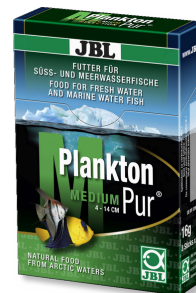
JBL PlanktonPur MEDIUM Treats for large aquarium fish