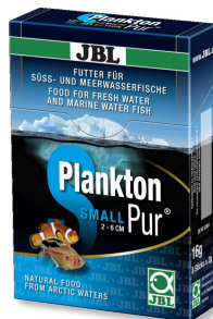
JBL PlanktonPur SMALL Treats for small aquarium fish