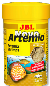
JBL NovoArtemio Artemia supplement diet for all aquarium fish