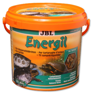
JBL Energil Main food for turtles and pond terrapins