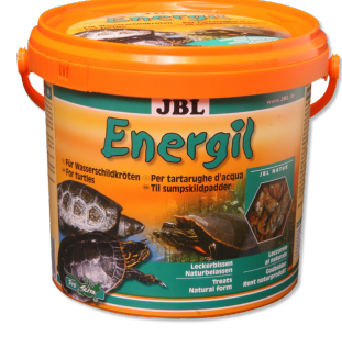
JBL Energil Main food for turtles and pond terrapins