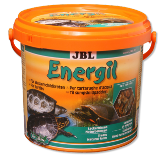
JBL Energil Main food for turtles and pond terrapins