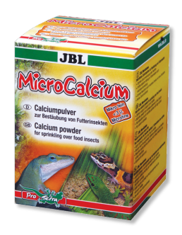
JBL MicroCalcium Mineral supplementary food for all reptiles