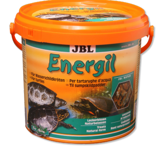
JBL Energil Main food for turtles and pond terrapins